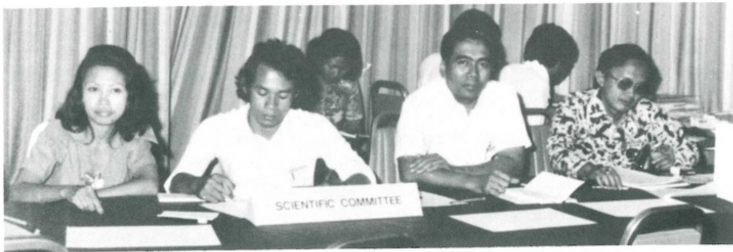
Members of the Scientific Committee.