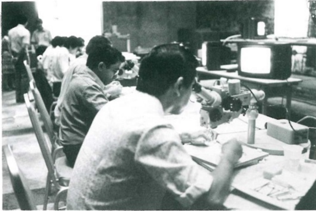
Ophthalmologists at a microsurgical workshop watching techniques transmitted through video monitors.