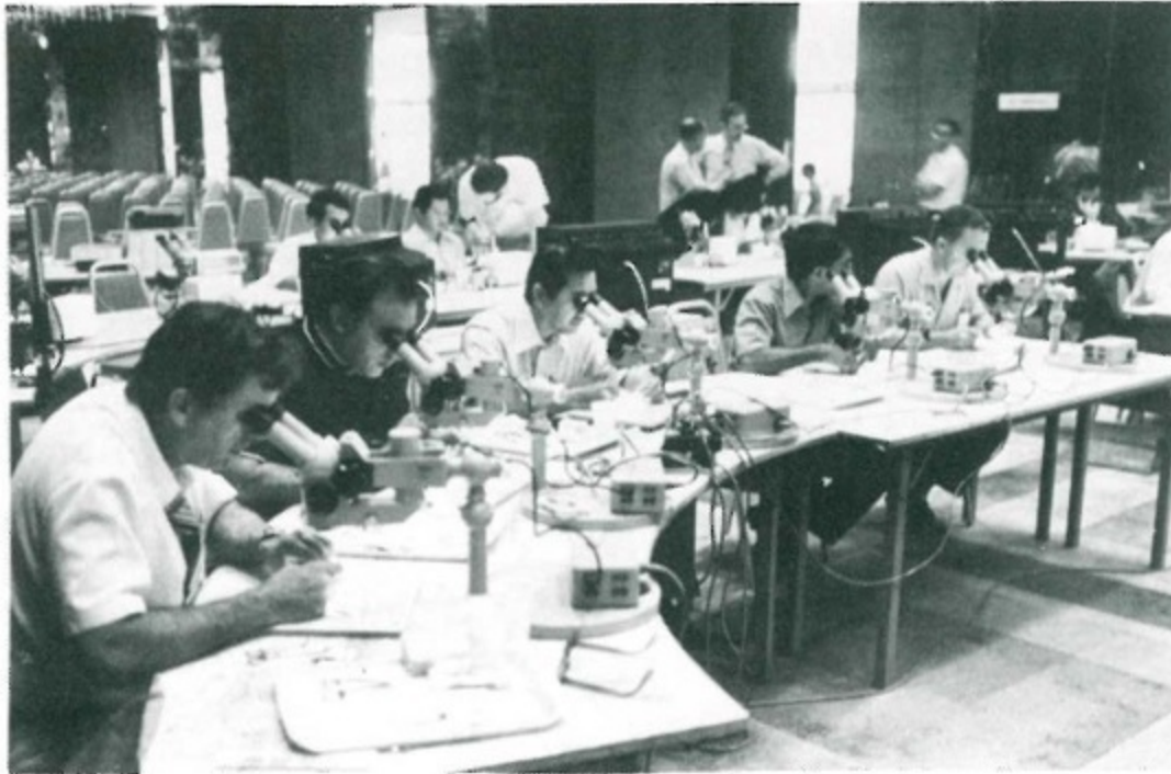
Ophthalmologists learn microsurgery by practising on animal's eyes.