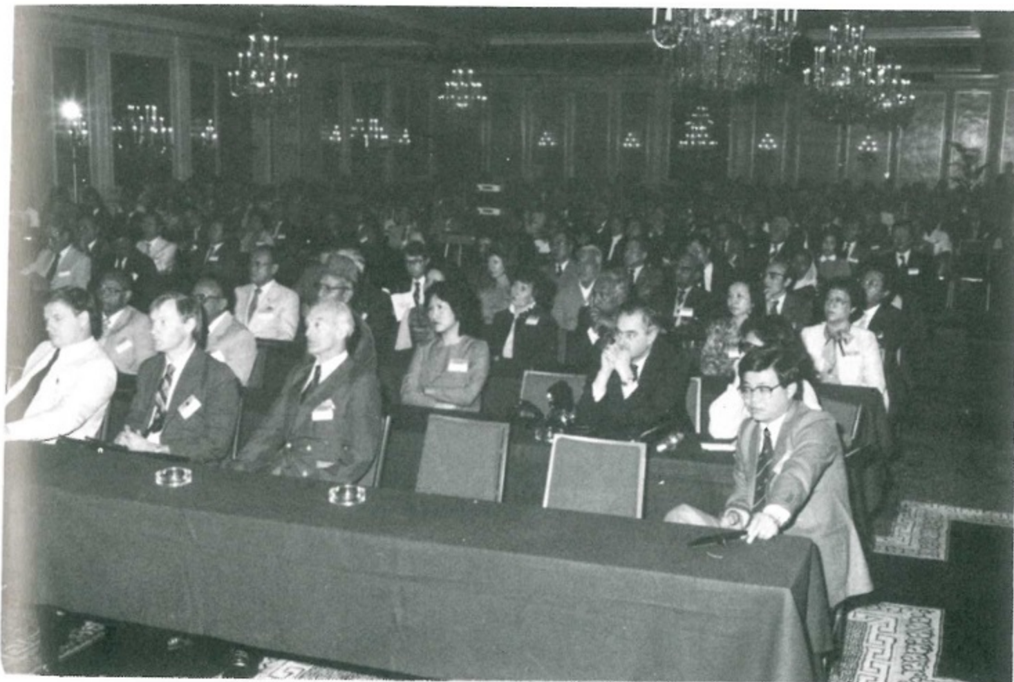
The crowd at the Opening Ceremony.