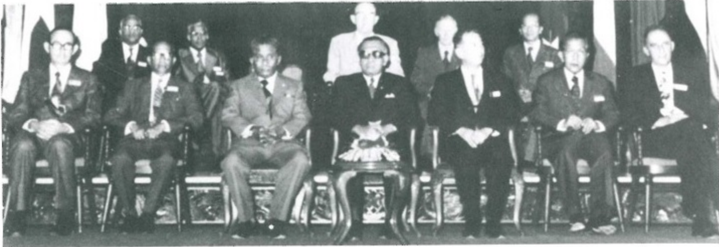
Sixth APAO Congress in Bali (1976).

“I wish you the best success in your discussions which I am sure will render significant contributions to the further development and refinement of that wonderful part of science that each of you has chosen to dedicate himself to.”