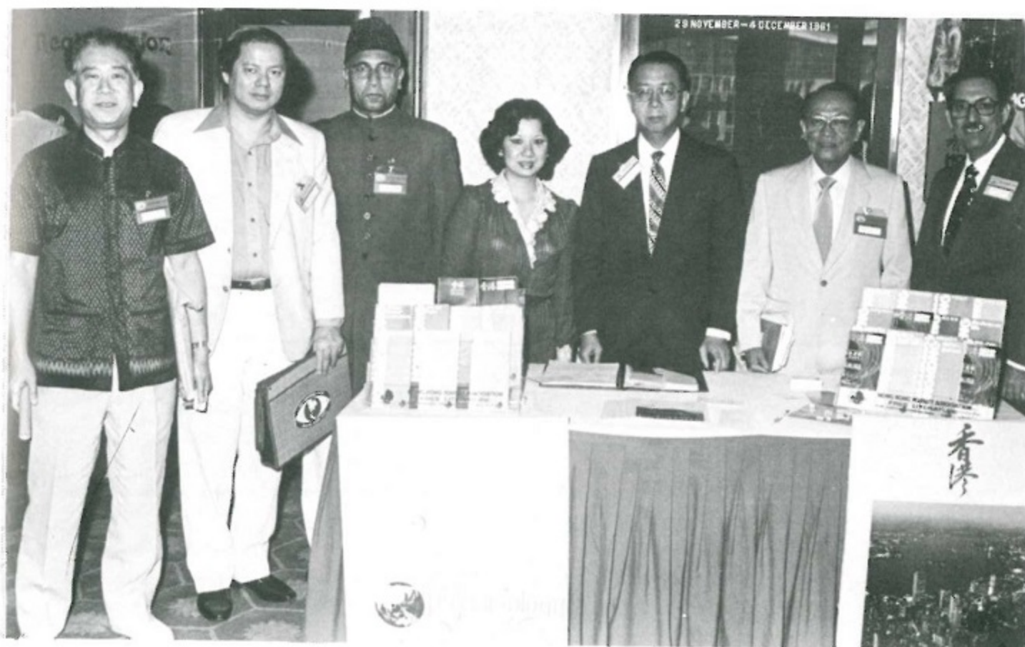
Council members supporting Congress in Hong Kong