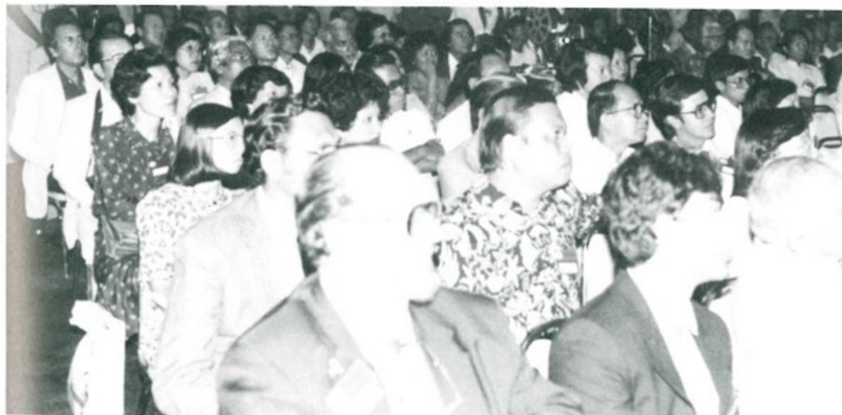
A scene at one of the Teaching Courses. The overwhelming crowd was indicative of the popularity of the APAO's continuing education programmes.