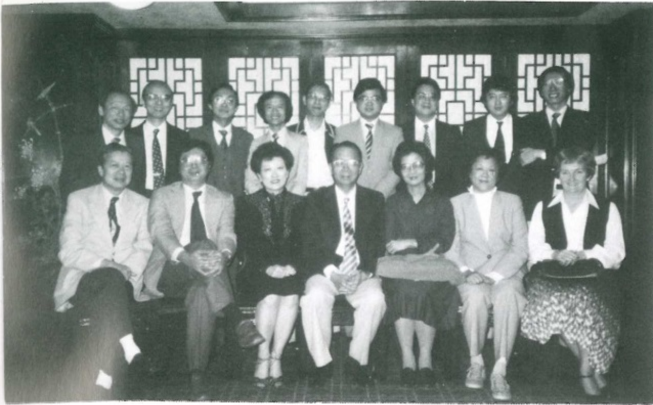
Ninth APAO Congress in Hong Kong (1983). The organisers