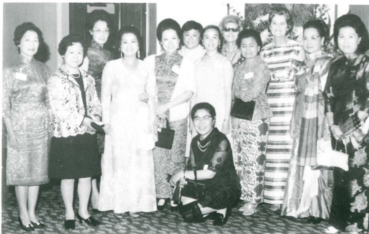
Participants of the Ladies's Program at the Fourth Congress.