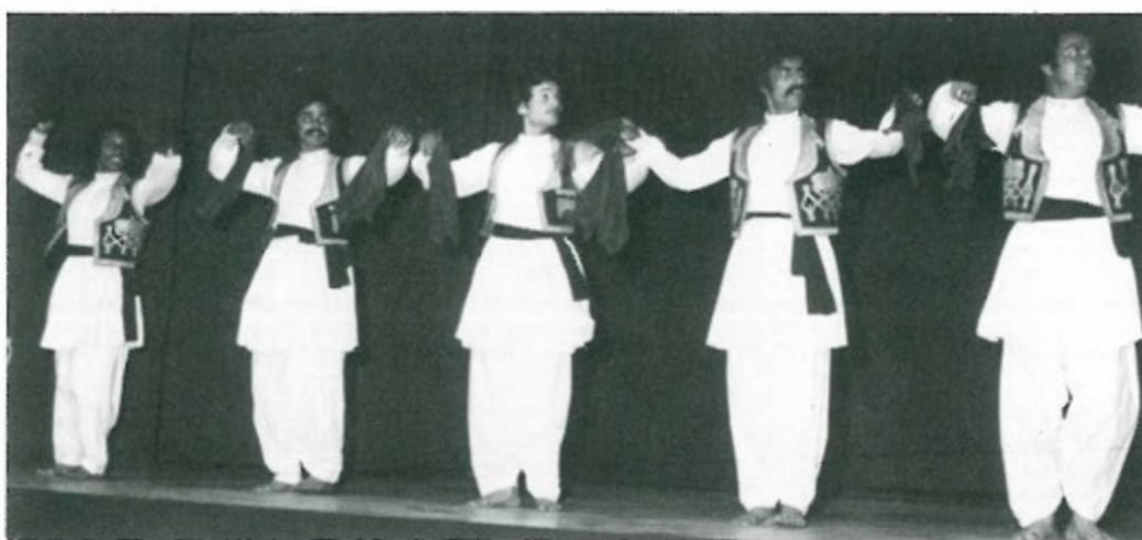
A delightful cultural show of Pakistani dances.