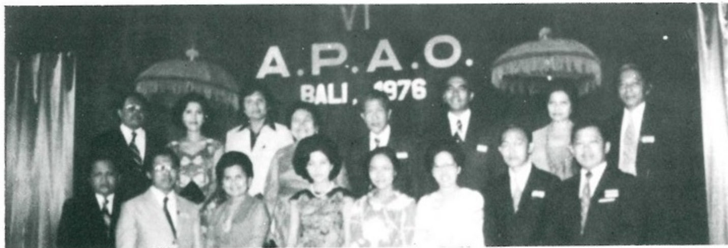
Members of the Social Committee.