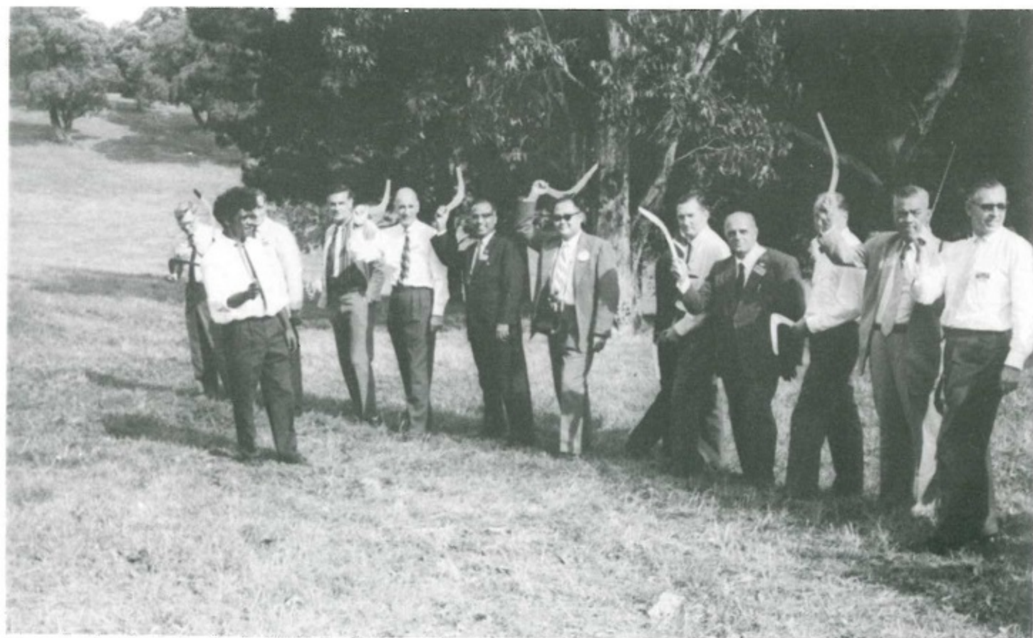
Delegates being taught to throw a boomerang by an aborigine.