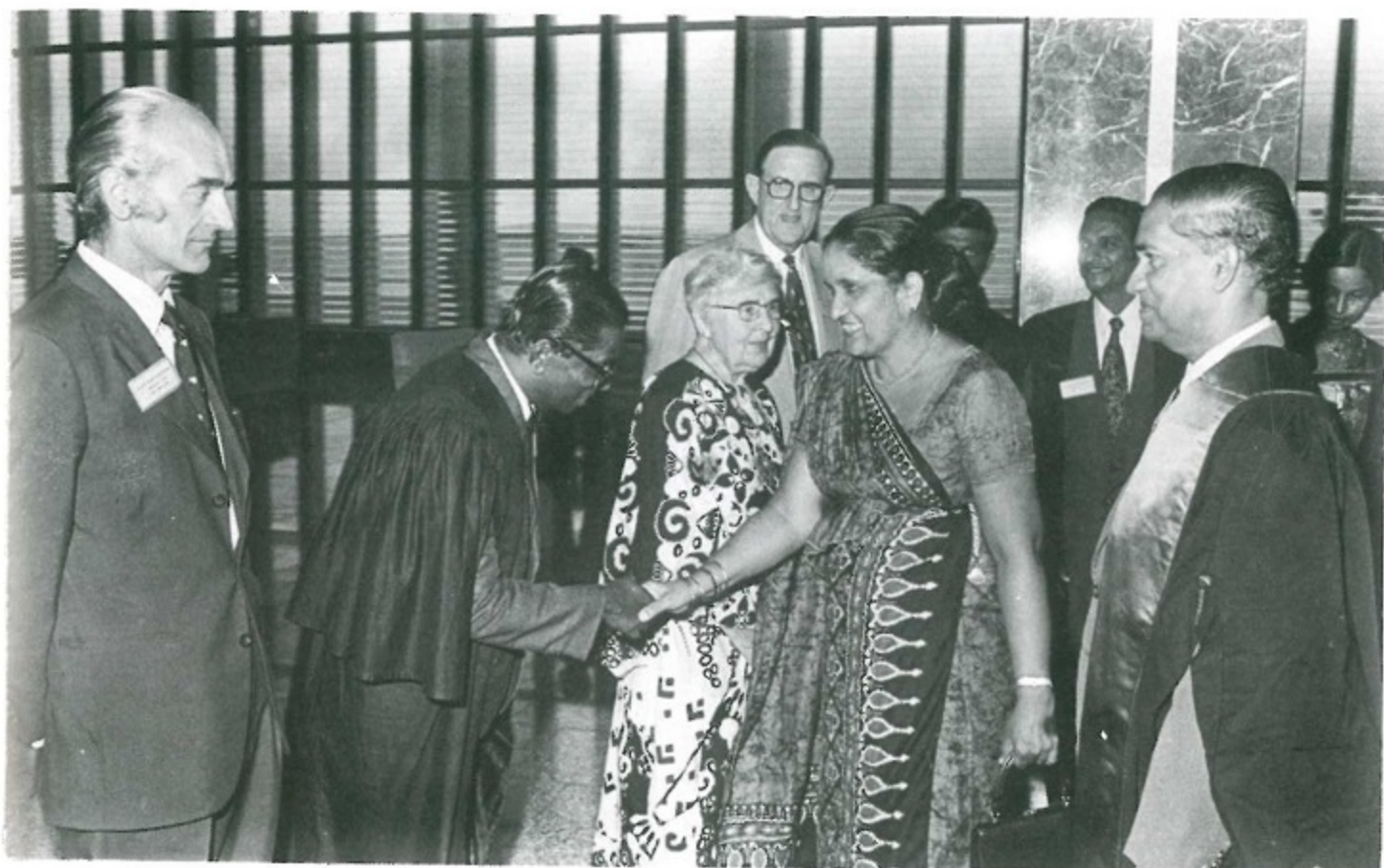
Fifth APAO Congress in Ceylon (1974). Prime Minister Mrs. Bandaranaike being introduced to Council members of the APAO.