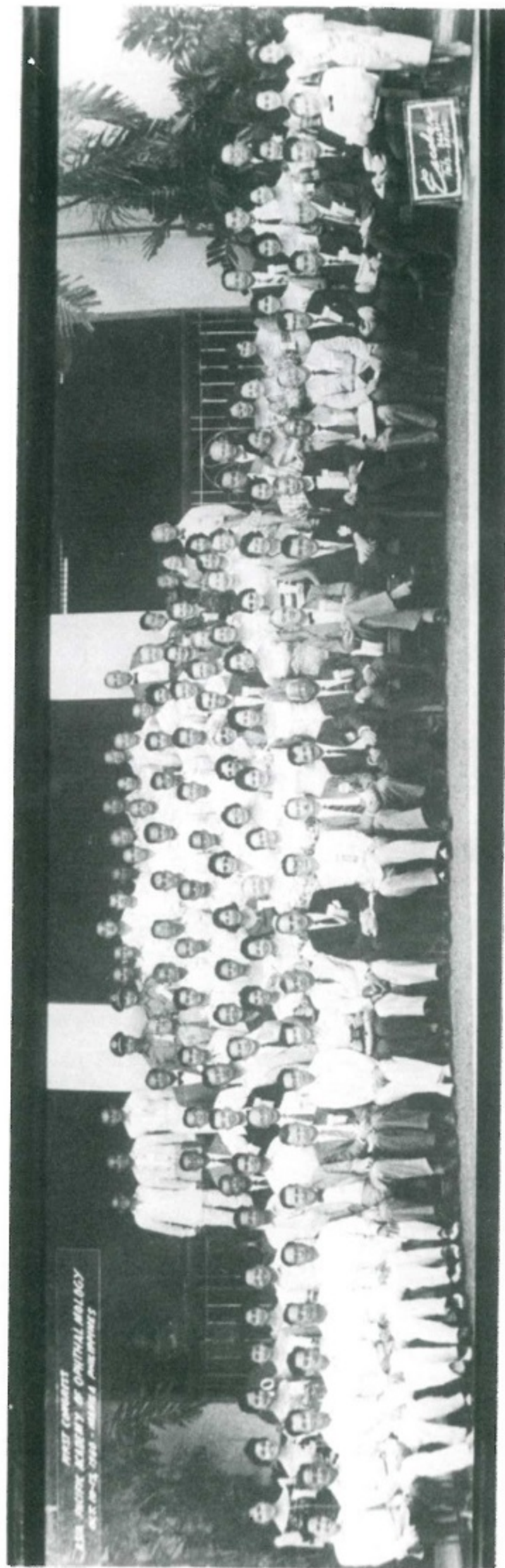
Members who attended the First Asia-Pacific Academy of Ophthalmology Congress held in Manila, October 1960.