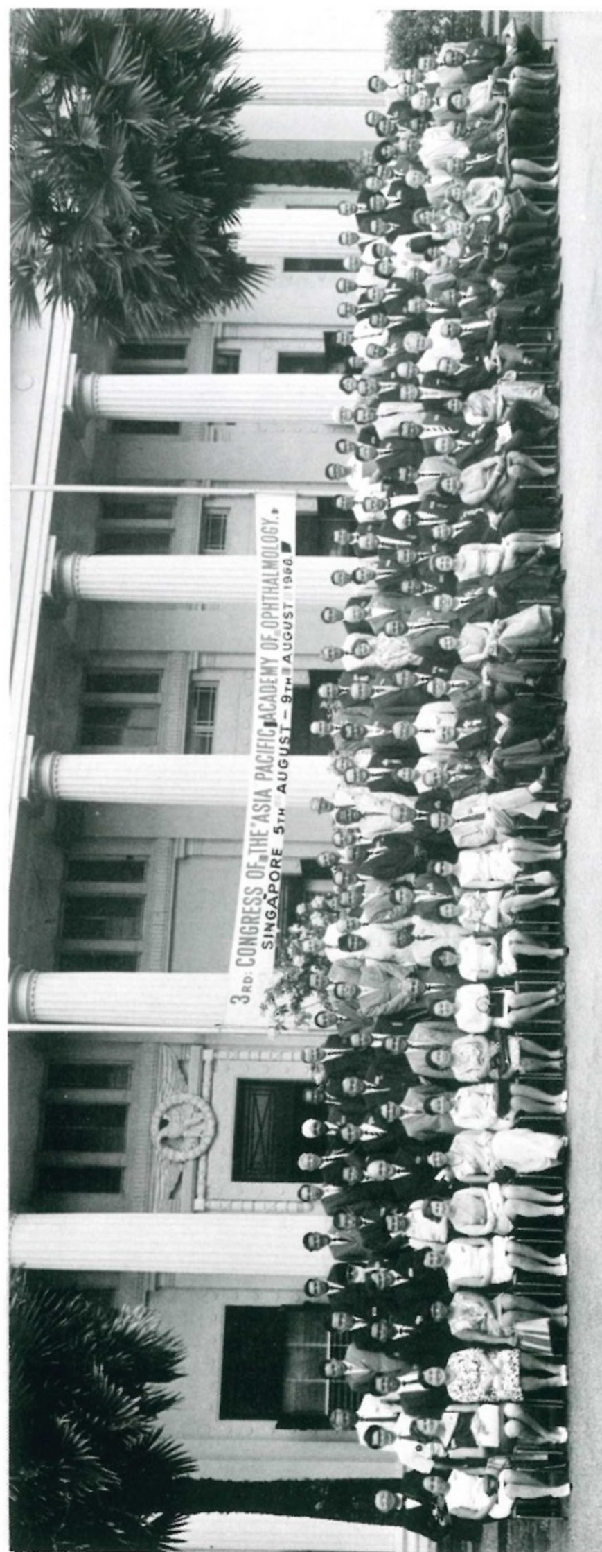
Group photograph of the delegates to the Third APAO Congress.